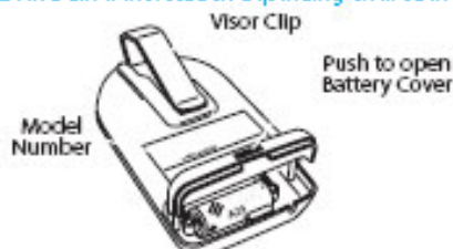
Figure 39 Remote Control Battery Replacement