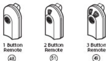
Figure 37 Genie Remote Controls